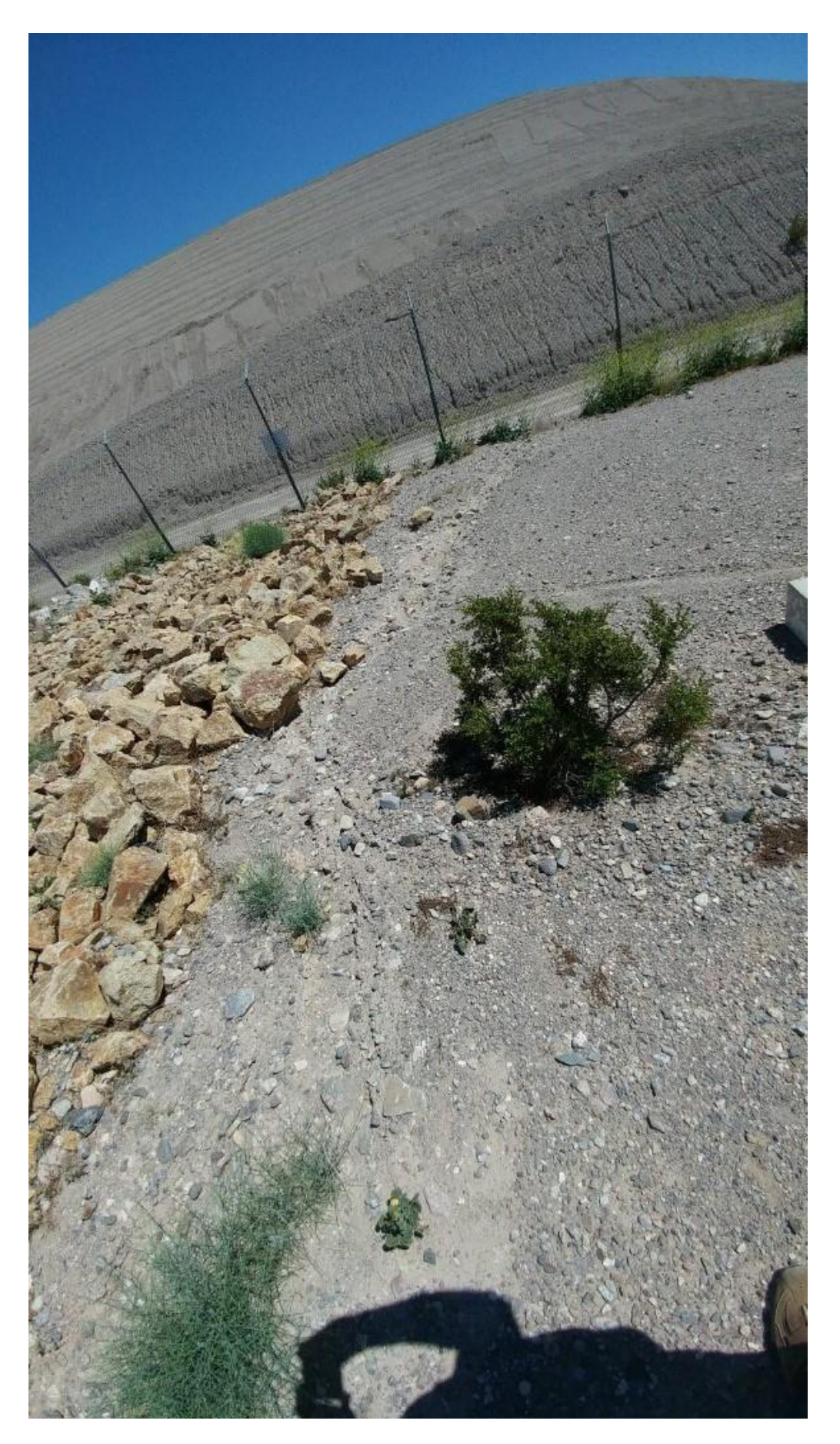
Public Health: Working for a Safer and Healthier Nevada