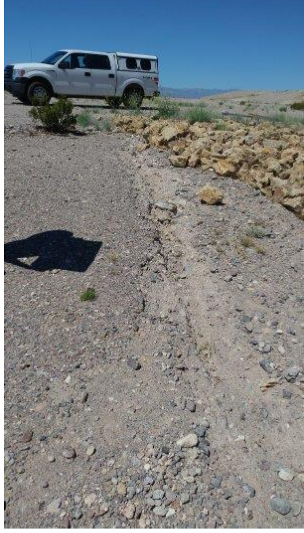
Public Health: Working for a Safer and Healthier Nevada