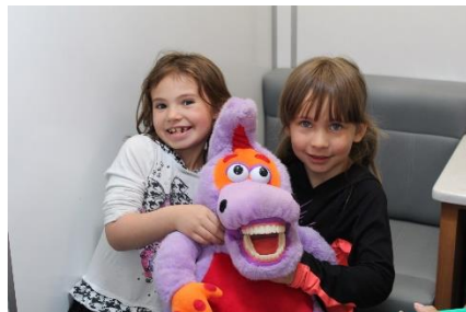
Presentation to Elementary School in McGill