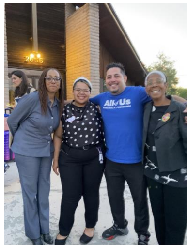
All of Us Kickoff Event in Northern Nevada, October 2022

By accessing the HEAP, stakeholders statewide gain access to a tool that enables them to pursue equitable solutions in various critical areas, including collecting data, building organizational capacity, fostering community engagement, ensuring language access, driving policy change, and enhancing emergency preparedness. You can find the HEAP resource by visiting this link: NOMHE Health Equity Action Plan .