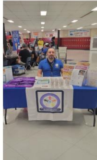
Nevada Health Provider Summit, April 2022 (Both photos on left) and NOMHE's Back to School Health Fair, Hellen Cannon Middle School, August 2022 (Right)

By accessing the HEAP, stakeholders statewide gain access to a tool that enables them to pursue equitable solutions in various critical areas, including collecting data, building organizational capacity, fostering community engagement, ensuring language access, driving policy change, and enhancing emergency preparedness. You can find the HEAP resource by visiting this link: NOMHE Health Equity Action Plan .