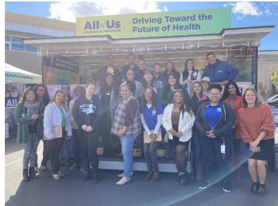
NOMHE Team with the All of Us Program.