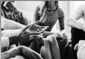
Alcohol and Drug Free Supportive Community