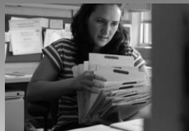
Intensive and Targeted Case Management