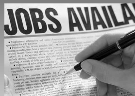
Life Skills/ Life Management Programming