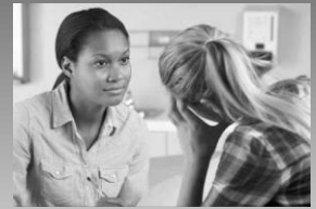
Linkage to Medical & Behavioral Health Services