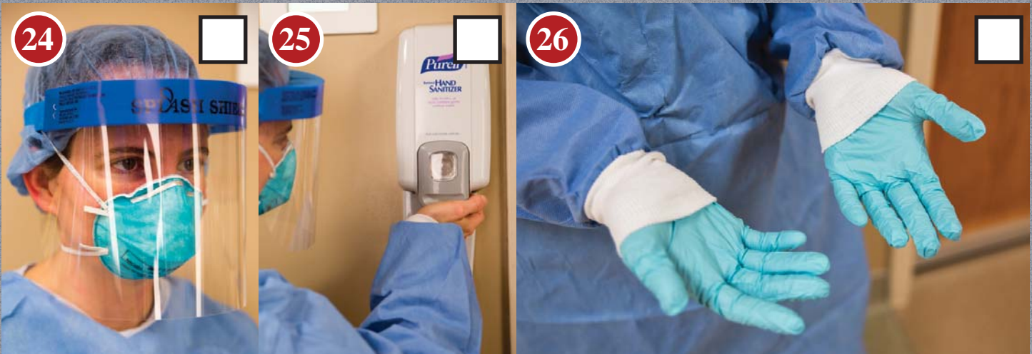
24 Apply face shield (over surgical cap and N95 straps). 25 Perform hand hygiene. 26 Apply standard patient care gloves. Bring cuffs of gown over the patient care glove cuff.