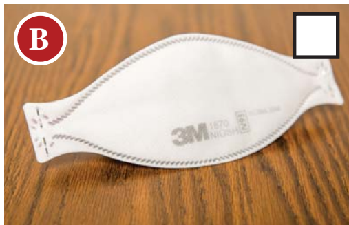
B The blue N95 masks were causing skin breakdown on noses. The white tri-fold N95 mask was found to be more comfortable for long term use.