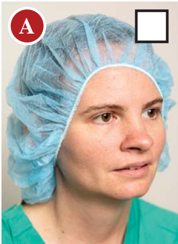
A The headcovers were pulled over the ears during patient care for additional protection.