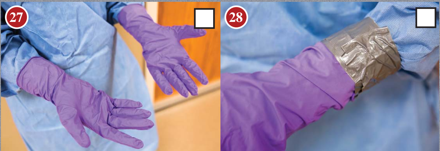
27 Apply long cuff KC500 Purple Nitrile gloves over the standard patient care gloves. Make sure that the glove cuff covers the gown sleeve adequately to prevent exposure when providing patient care. 28 If activities performed in the room are likely to dislodge the cuff, it is acceptable to tape the gown sleeve and glove cuff to one another.

! If the patient's condition warrants, additional personal protective equipment may be added to these guidelines. This may include items such as Tyvek suits, powered air purifying respirators, and aprons.